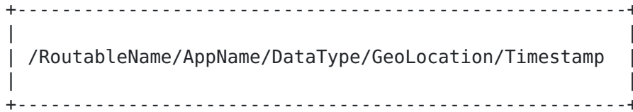
Figure 2: Name Structure for Pub/Sub in ICN-VN

information dissemination [ WANG12 ]. However, this structure is for V2V communication. This document proposes a name structure for V2I communication by expanding that.