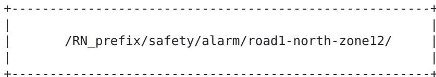
Figure 4: Subscribe Name Example