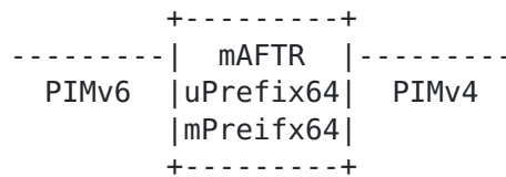
Figure 3: PIMv6-PIMv4 Interworking Function

The mAFTR contains two separate Tree Information Bases (TIBs): the IPv4 Tree Information Base (TIB4) and the IPv6 Tree Information Base (TIB6), which are bridged by one IPv4-in-IPv6 virtual interface. It should be noted that TIB implementations may vary (e.g., some may rely upon a single integrated TIB without any virtual interface), but they should follow this specification for the sake of global and functional consistency.