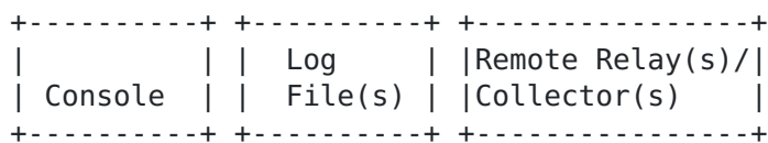
Figure 1. Syslog Processing Flow

The leaves in the syslog model "actions" container correspond to each message collector: