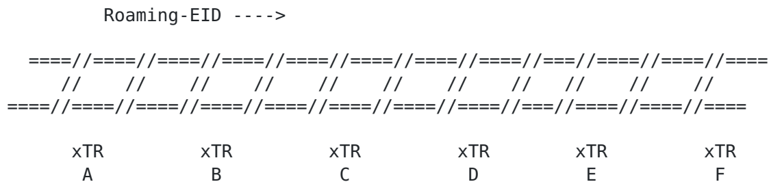
Figure 1: Directional Mobility

For the send direction from roaming-EID to any destination can be accomplish as a local decision. As long as the roaming-EID is in signal range to any xTR along the path, it can use it to forward packets. The LISP xTR, acting as an ITR, can forward packets to destinations in non-LISP sites as well as to stationary and roaming EIDs in LISP sites. This is accomplished by using the LISP overlay via dynamic packet encapsulation. When the roaming-EID sends packets, the LISP xTR must discover the EID and MAY register the EID with a set of RLOCs to the mapping system [ I-D.portoles-lisp-eid-mobility ]. The discovery process is important because the LISP xTR, acting as an ETR for decapsulating packets that arrive, needs to know what local ports or radios to send packets to the roaming-EID.